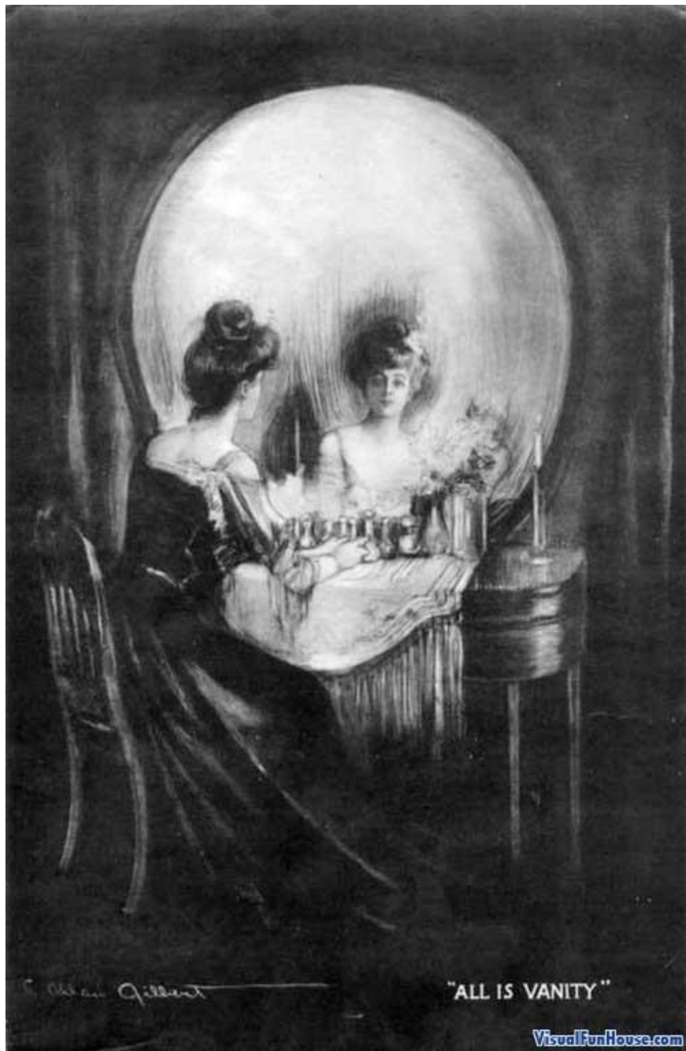
"ALL IS VANITY"