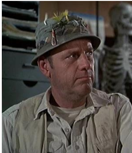
“Lt.Col. Henry Blake” M*A*S*H