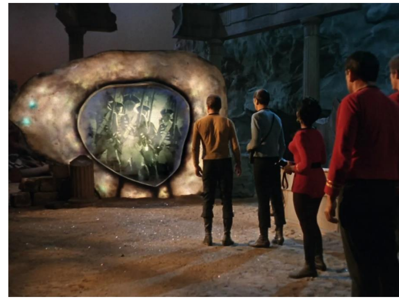
ST:TOS The City on the Edge of Forever