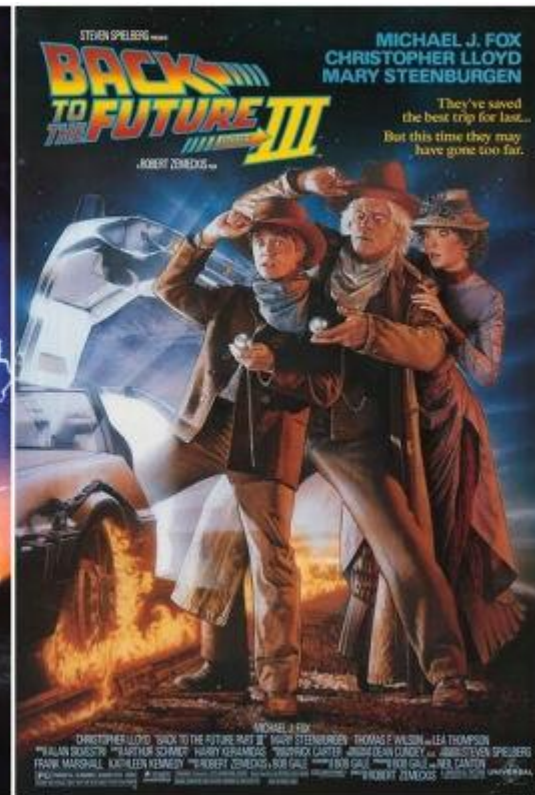
Back to the Future, parts I/II/III