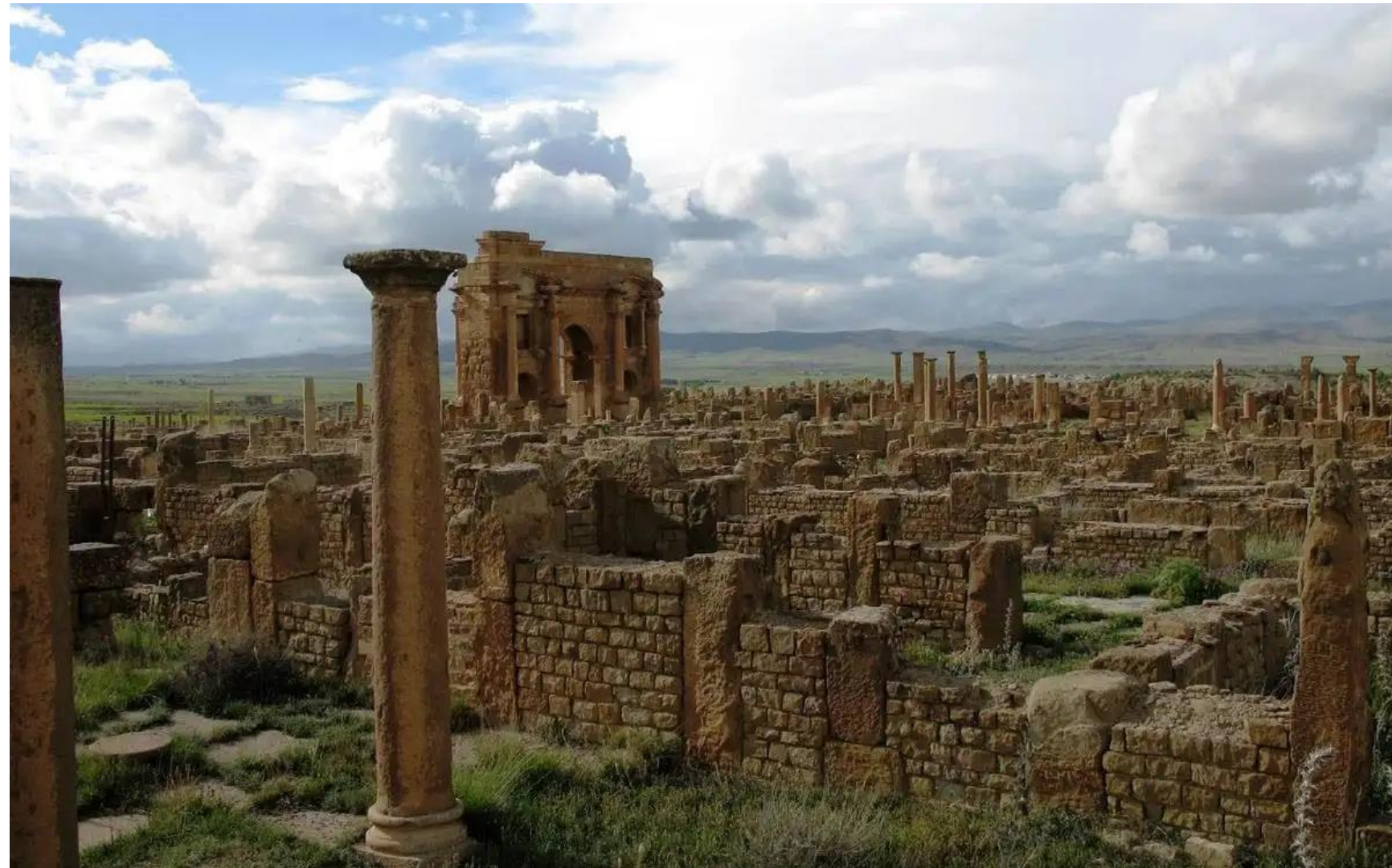
Roman ruins in Algeria, near Augustine's home city