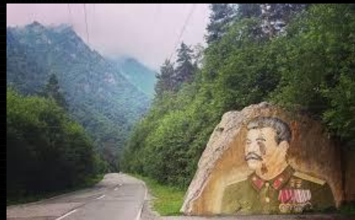
Monument of the warrior in the rock, south Ossetia South Ossentia – population 53k. (Medford-53k, Ashland 21k)