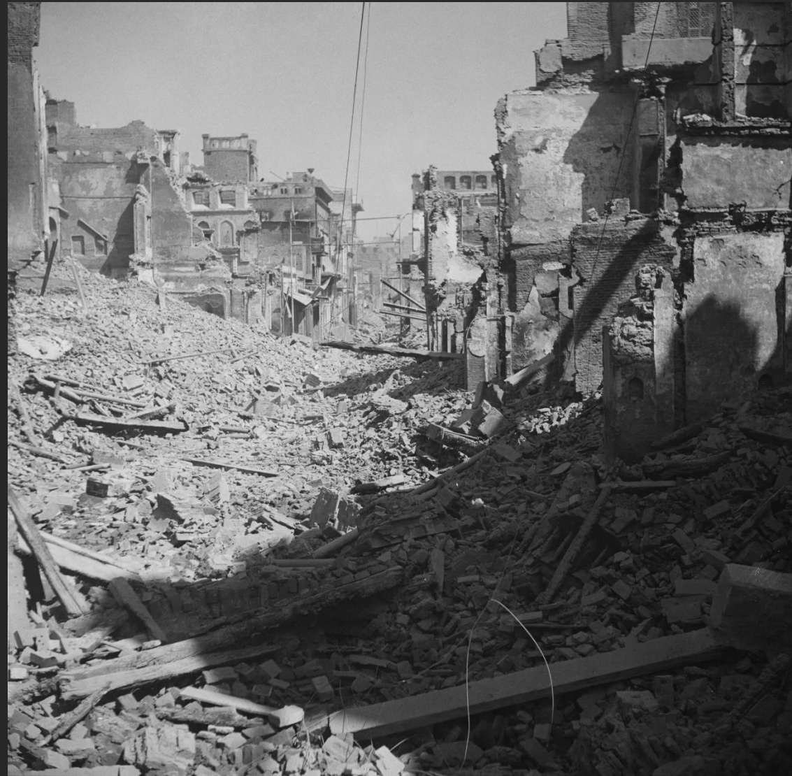
March 1947, city of Punjab